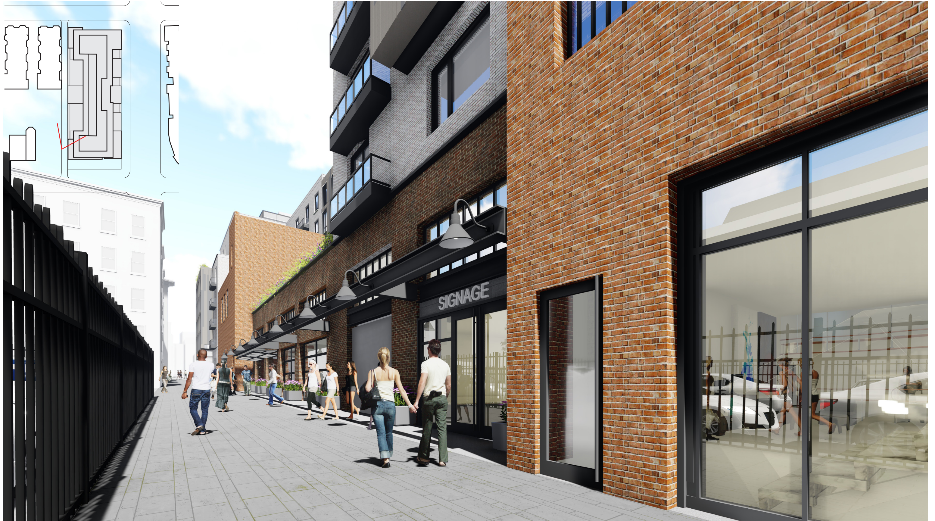
VIEW WITHIN RETAIL ALLEY LOOKING NORTH